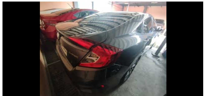
Right Quarter Panel