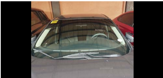
Front Window Screen