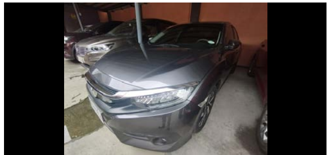
Left Side Profile