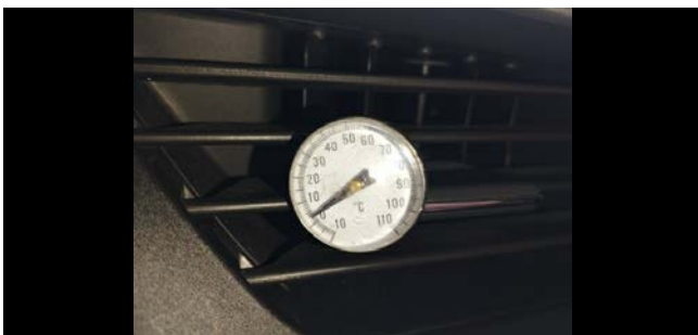
AC Temperature Result