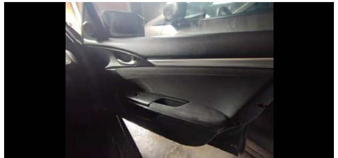
Front Door Trim