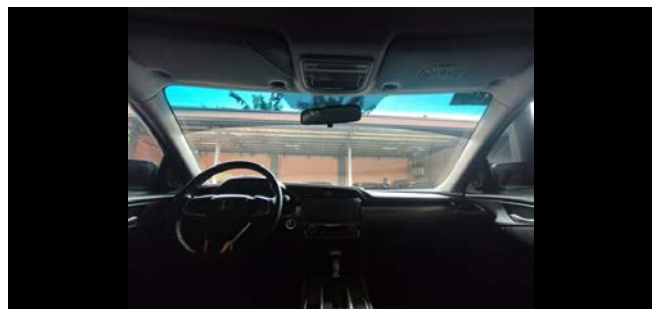
Front Window Screen from Rear Seat