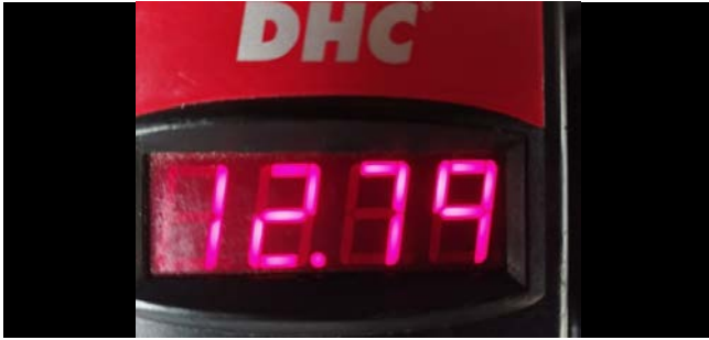
Battery Performance Result