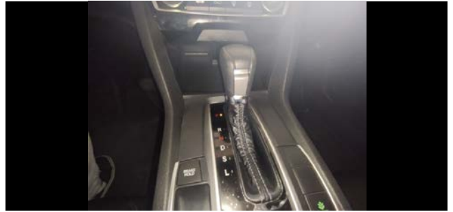
Gear Shift Lever