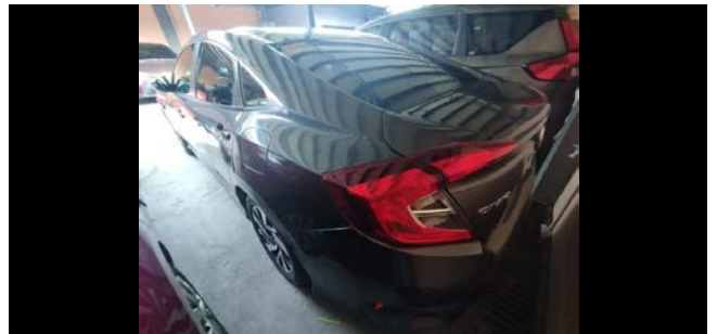
Left Quarter Panel