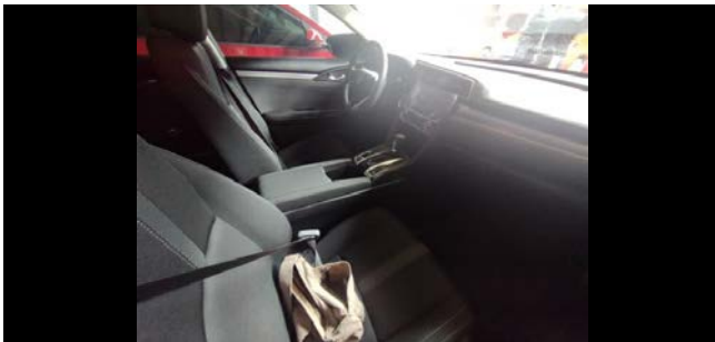
Front Right Side Interior View