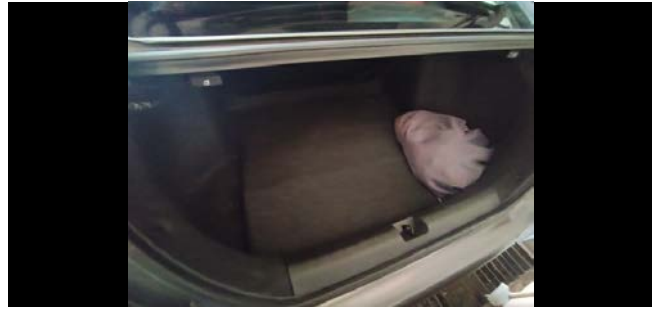
Inner Tail Gate