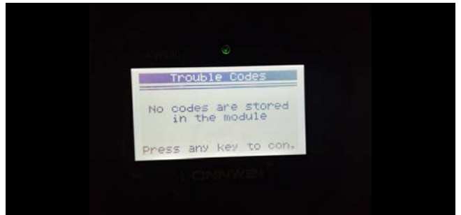
OBD Result Screen Shot