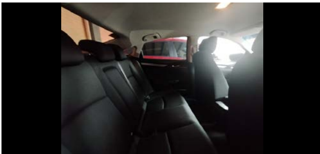
Rear Seats Interior View