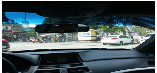
Front Window Screen from Rear Seat