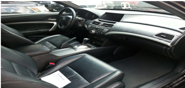
Front Right Side Interior View