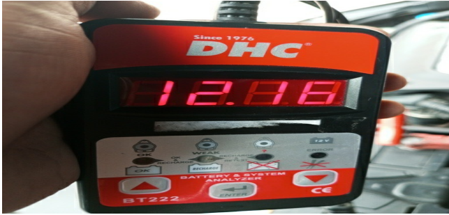
Battery Performance Result