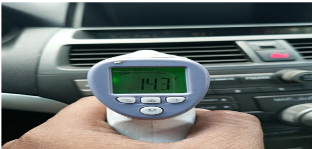
AC Temperature Result