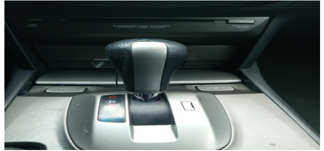
Gear Shift Lever