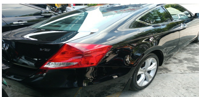
Right Quarter Panel