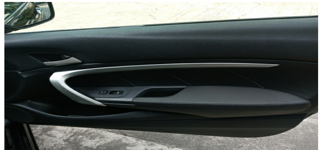
Front Door Trim