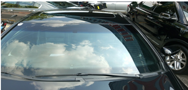
Front Window Screen