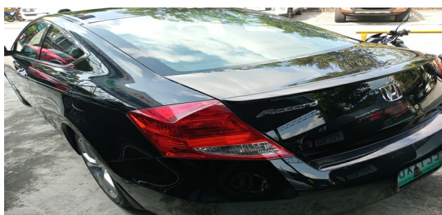
Left Quarter Panel