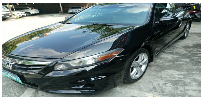
Left Side Profile