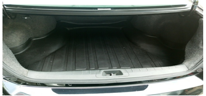
Inner Tail Gate