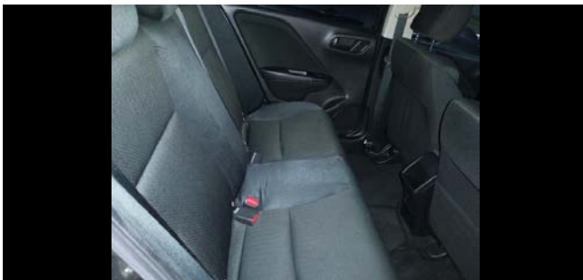
Rear Seats Interior View