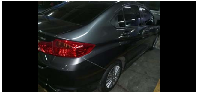
Right Quarter Panel