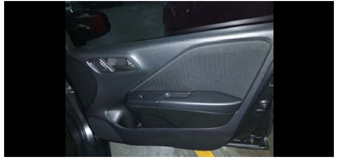
Front Door Trim