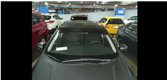
Front Window Screen