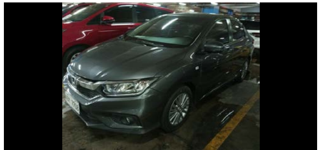
Left Side Profile