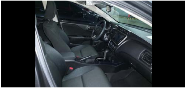
Front Right Side Interior View