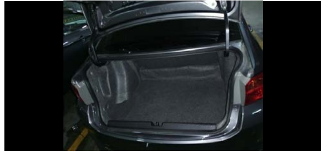
Inner Tail Gate