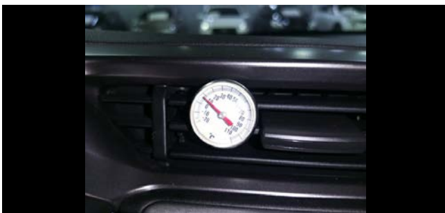
AC Temperature Result