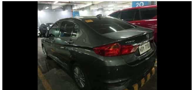
Left Quarter Panel