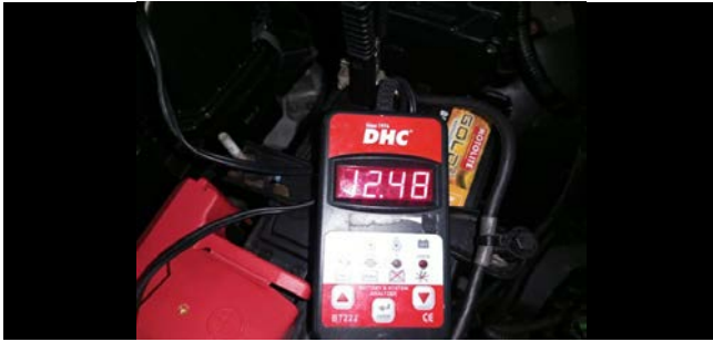
Battery Performance Result