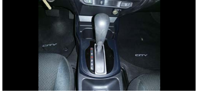
Gear Shift Lever