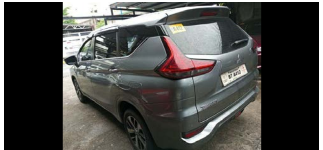
Left Quarter Panel