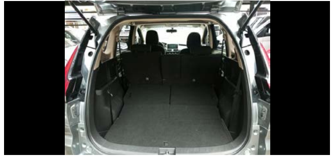
Inner Tail Gate