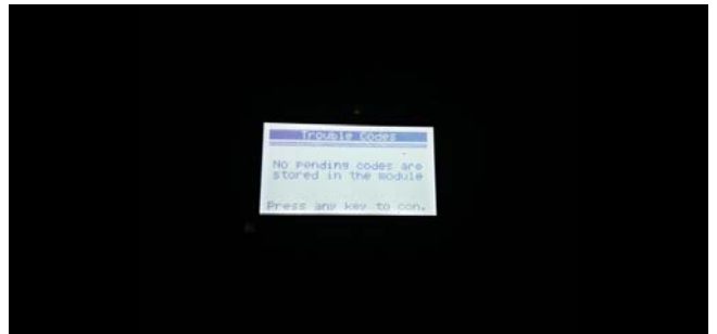
OBD Result Screen Shot