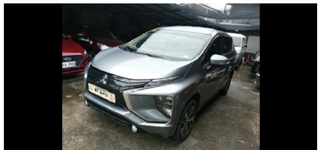
Left Side Profile