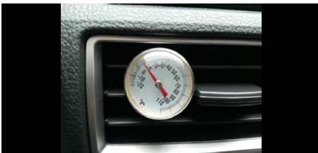
AC Temperature Result