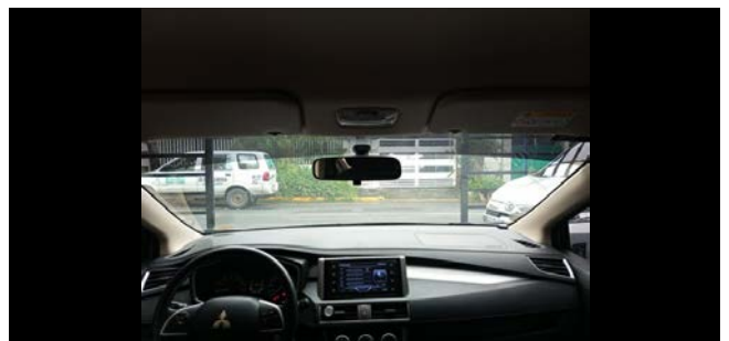
Front Window Screen from Rear Seat