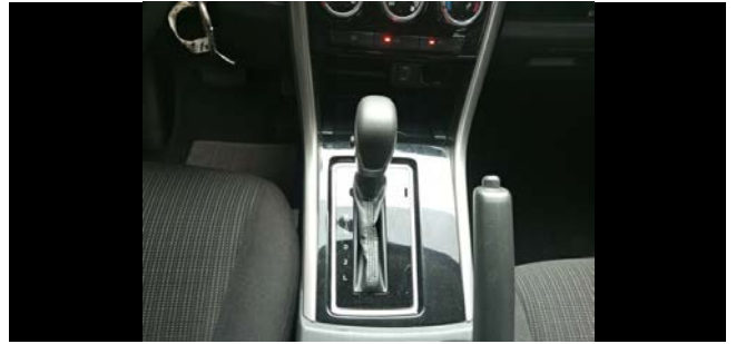
Gear Shift Lever