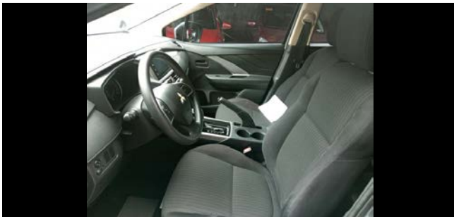
Front Right Side Interior View