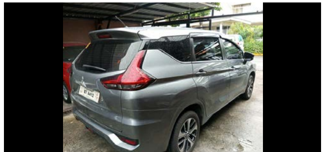
Right Quarter Panel