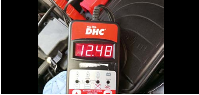
Battery Performance Result