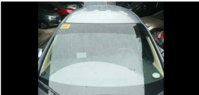
Front Window Screen