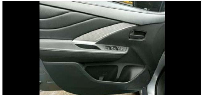
Front Door Trim