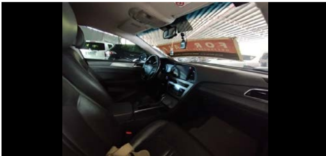
Front Right Side Interior View