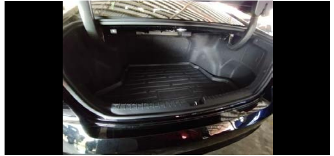
Inner Tail Gate