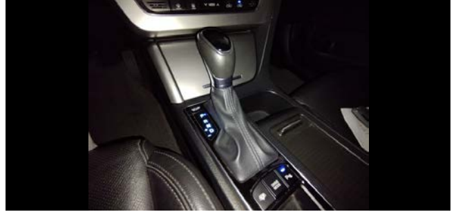
Gear Shift Lever