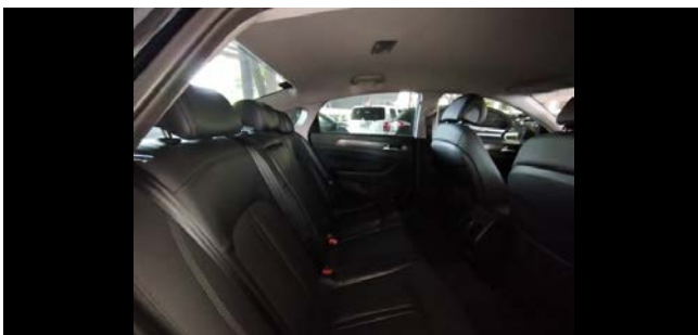
Rear Seats Interior View