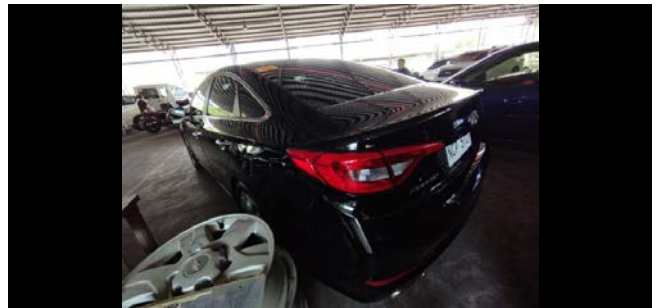
Left Quarter Panel