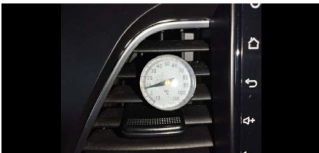
AC Temperature Result