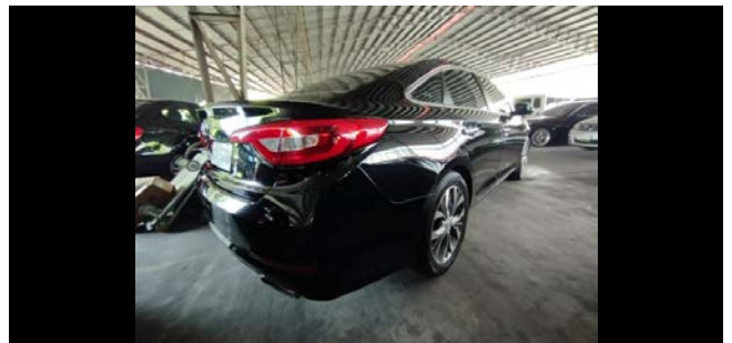
Right Quarter Panel