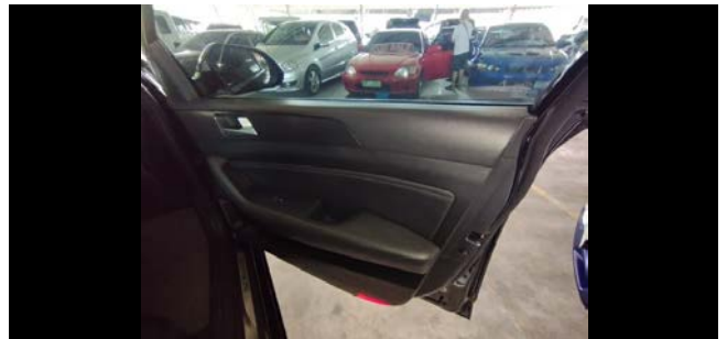
Front Door Trim