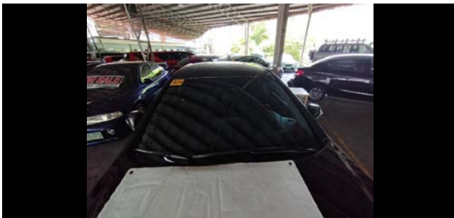
Front Window Screen