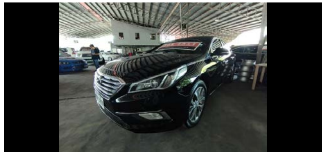
Left Side Profile