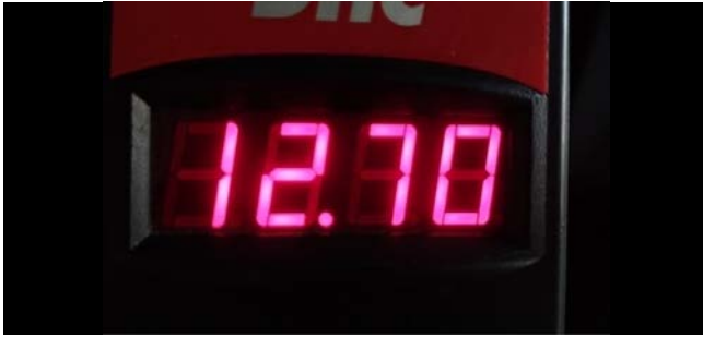
Battery Performance Result