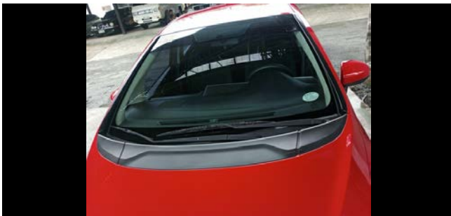
Front Window Screen