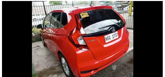
Left Quarter Panel