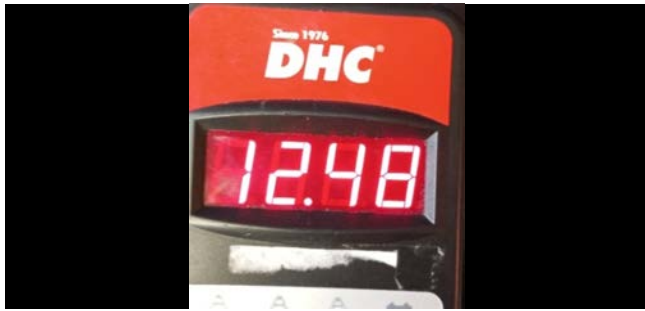
Battery Performance Result