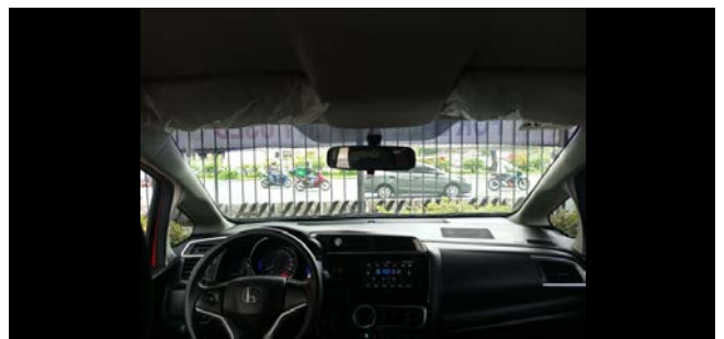
Front Window Screen from Rear Seat