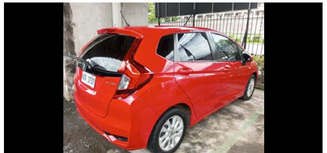
Right Quarter Panel