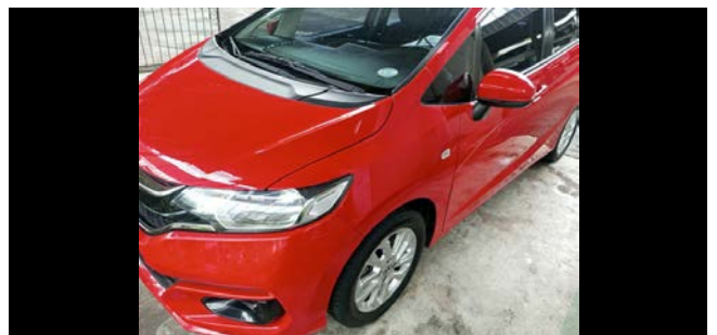
Left Side Profile