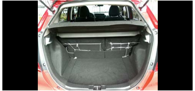
Inner Tail Gate