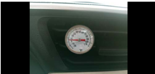
AC Temperature Result