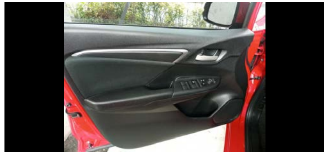
Front Door Trim