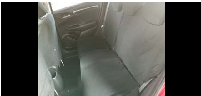
Rear Seats Interior View