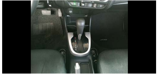
Gear Shift Lever