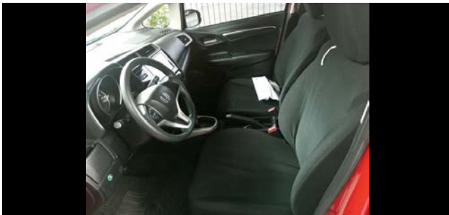
Front Right Side Interior View