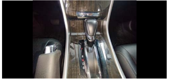
Gear Shift Lever