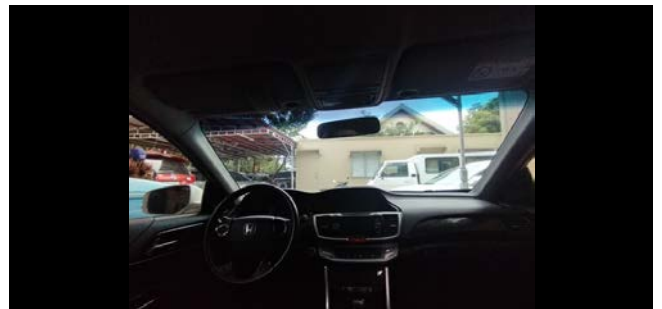
Front Window Screen from Rear Seat