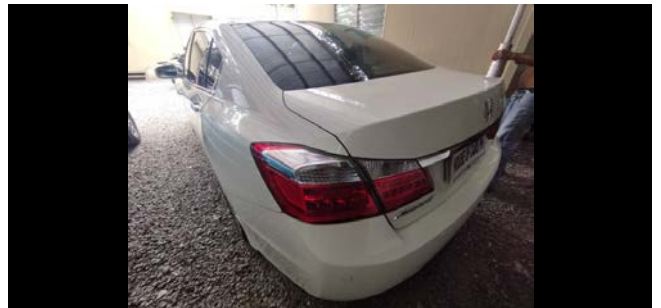
Left Quarter Panel