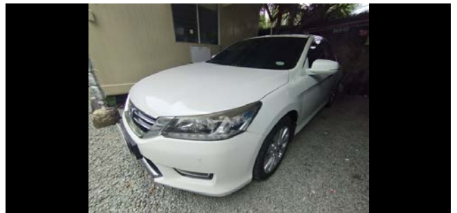
Left Side Profile