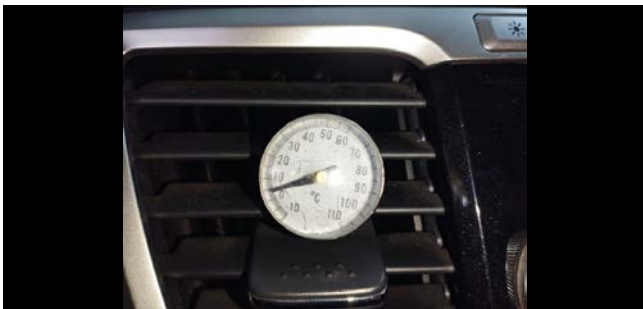
AC Temperature Result