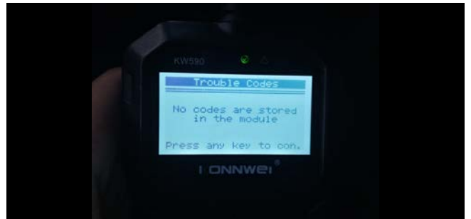
OBD Result Screen Shot