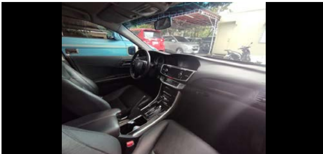
Front Right Side Interior View