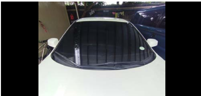
Front Window Screen