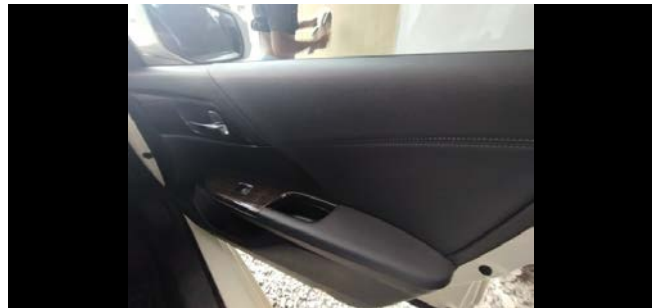
Front Door Trim