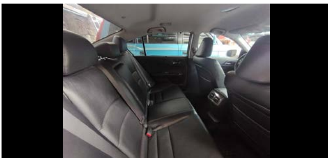
Rear Seats Interior View