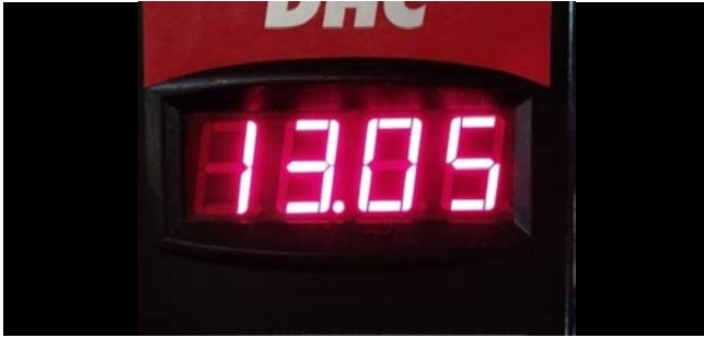
Battery Performance Result