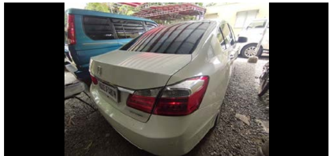
Right Quarter Panel