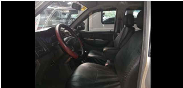
Front Right Side Interior View