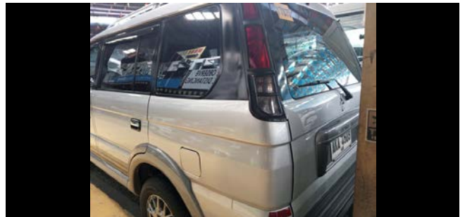
Left Quarter Panel