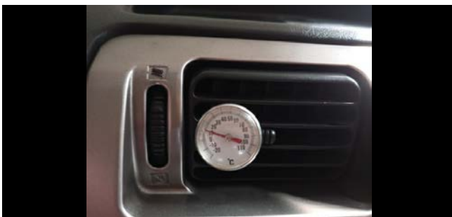
AC Temperature Result