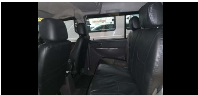
Rear Seats Interior View