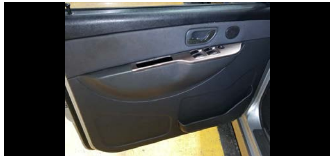
Front Door Trim