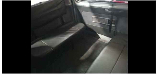
Inner Tail Gate