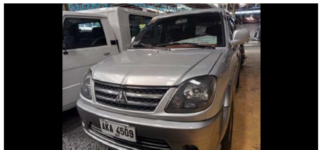
Left Side Profile