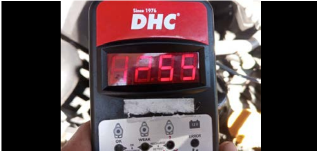
Battery Performance Result