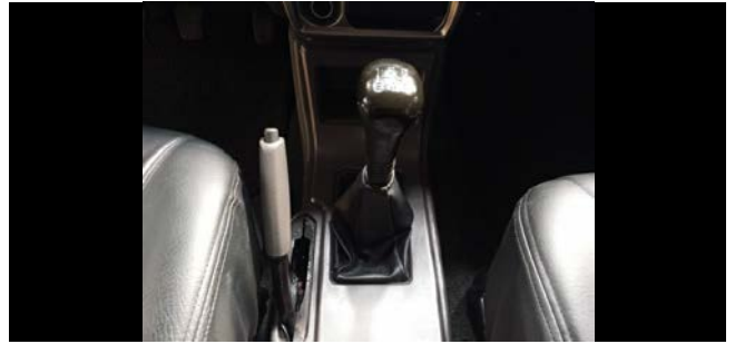
Gear Shift Lever