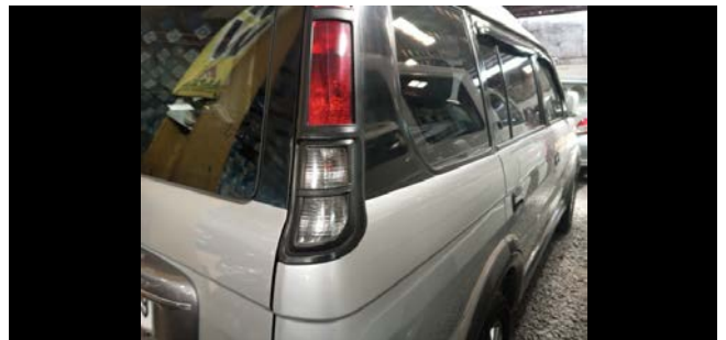
Right Quarter Panel