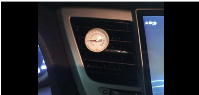
AC Temperature Result