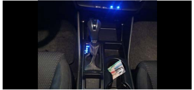
Gear Shift Lever