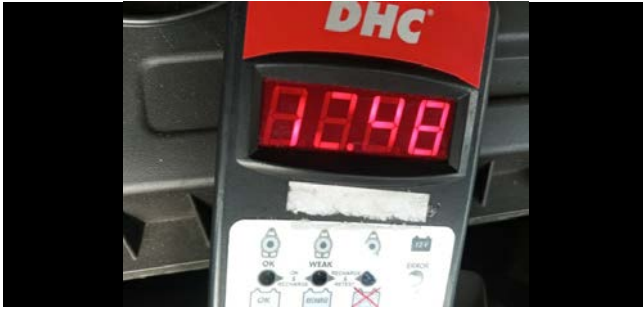
Battery Performance Result