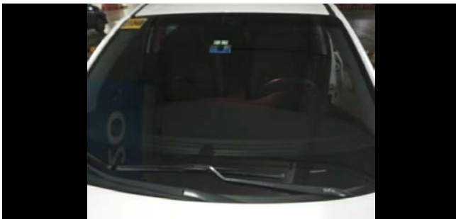
Front Window Screen