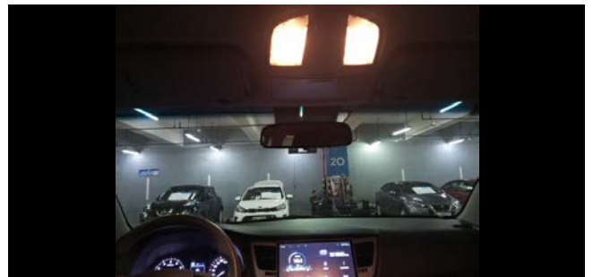
Front Window Screen from Rear Seat