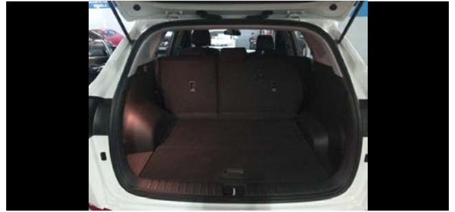
Inner Tail Gate