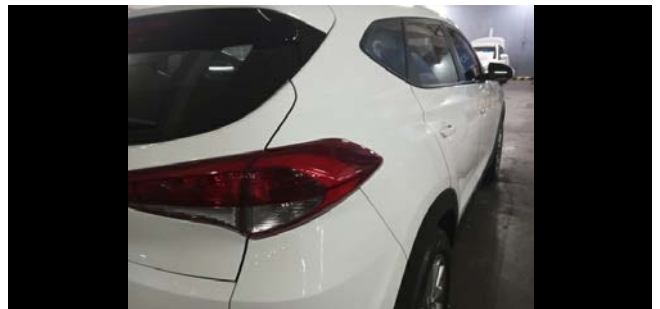
Right Quarter Panel