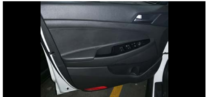
Front Door Trim