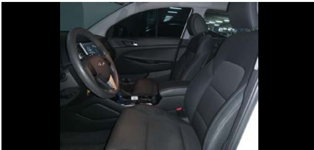
Front Right Side Interior View