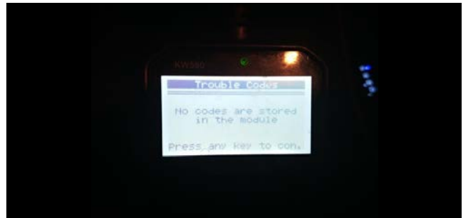
OBD Result Screen Shot