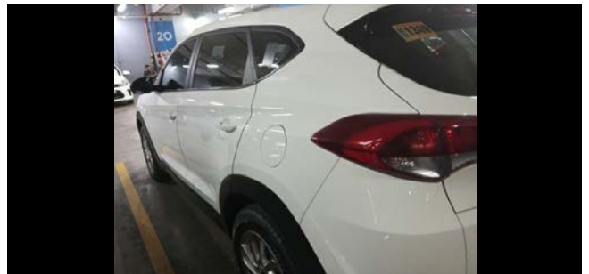
Left Quarter Panel